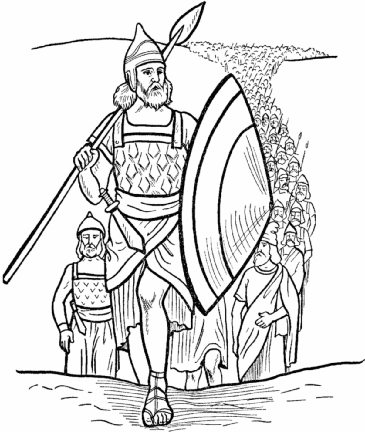
After the death of Moses, Joshua led the Hebrews in their battles for the Promised Land.